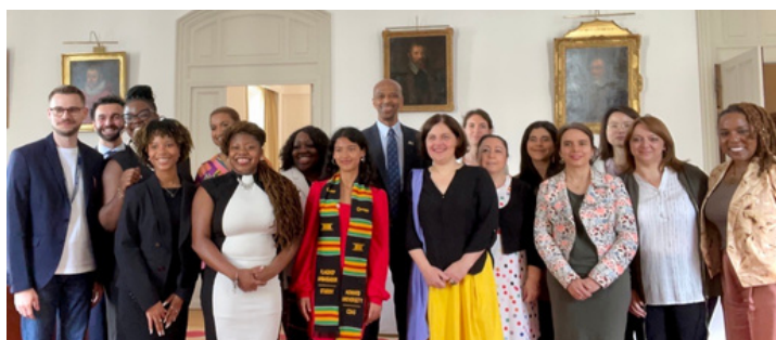
Howard University Delegation and Université Paris 1 Panthéon-Sorbonne Team