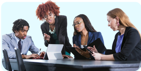
Taking charge of your own growth