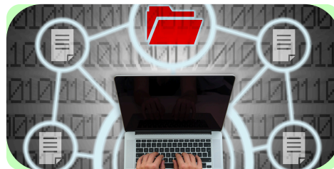
A digital badge you share on LinkedIn, resumes, and portfolios