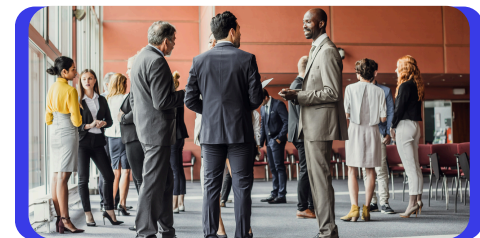
Priority Registration to career and leadership events