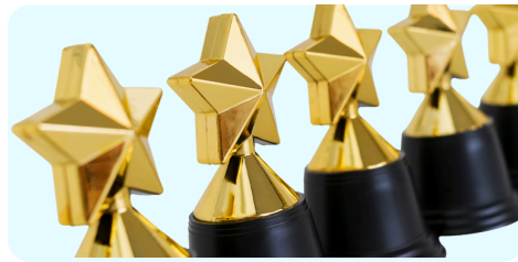
Recognition from The College of Arts and Sciences